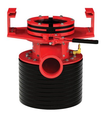
4000-7 Pneumatic Assembly Deflated with Stripper Rubber Closed